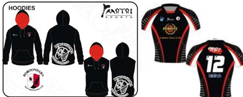
Supporter Hoodies & Senior Team Jerseys

The 2010 jersey has been released (see below) and it is very schmick. More details on new merchandise including Jerseys, stubby holders, all playing accoutrements and pricing etc will be available soon on the club website.